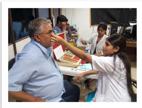
Photographs of eye check up & eye donation