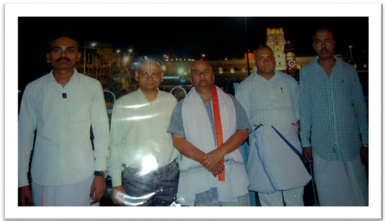
Before & After pictures of the team

A commitment taken of going to Tirupati after successful project completion