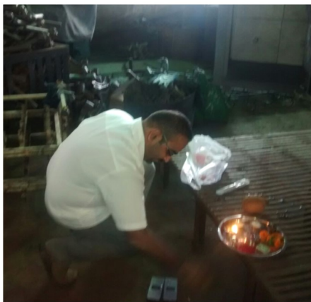
First operation start up Puja at the hands of a customer