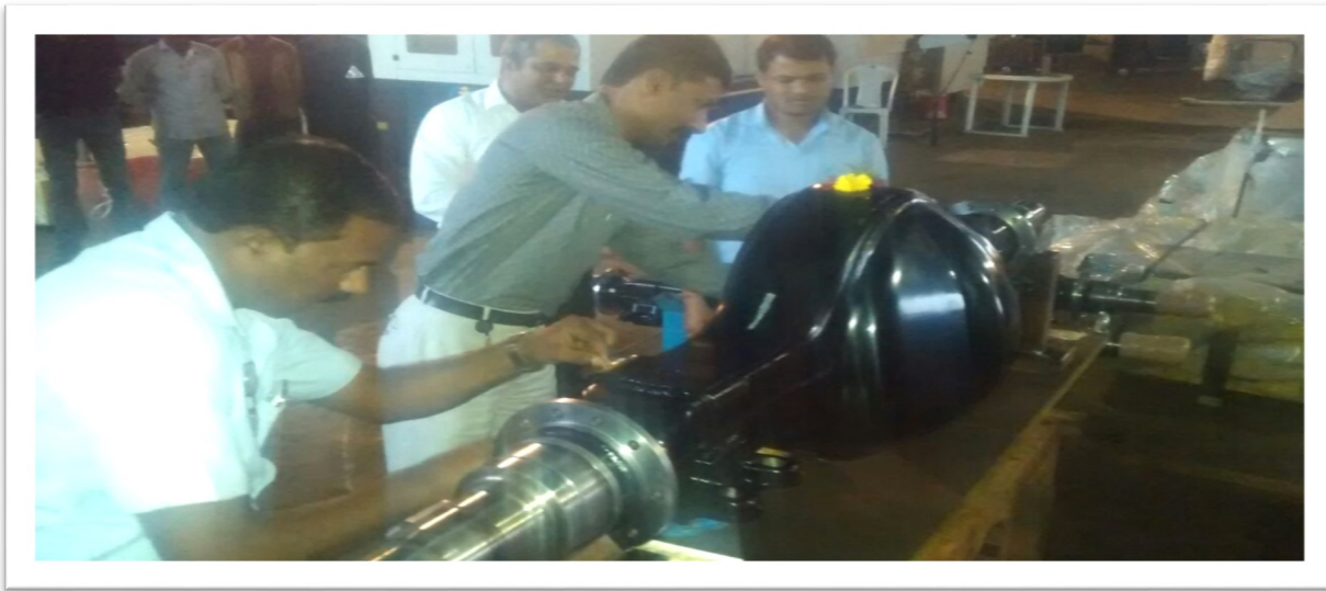
First Banjo dispatch at the hands of a customer

A commitment taken of going to Tirupati after successful project completion