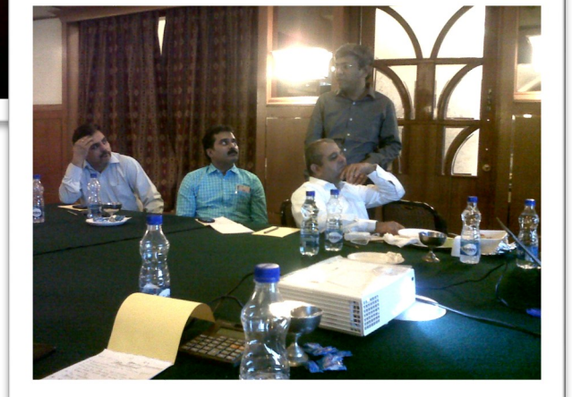
Balanced Score card Training for leadership Team